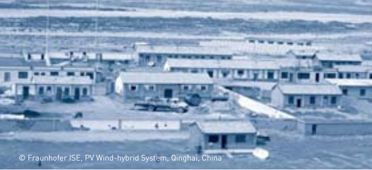
PV Wind-hybrid System, Qinghai, China