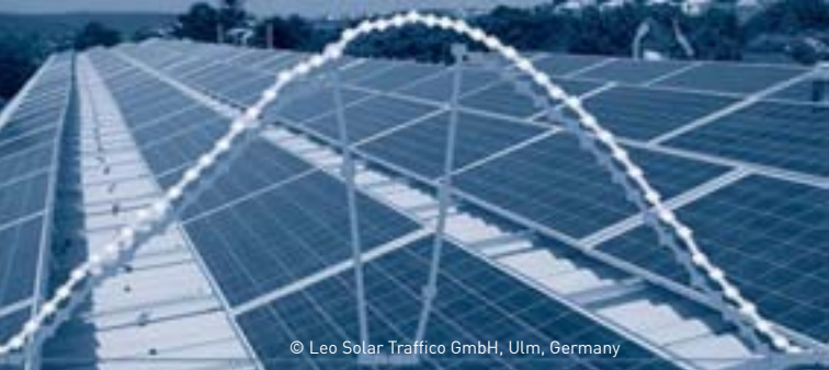
© Leo Solar Traffico GmbH, Ulm, Germany